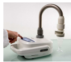
Coriolis® µ, Bertin Technologies